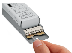
Inserting a conductor via push-in termination.