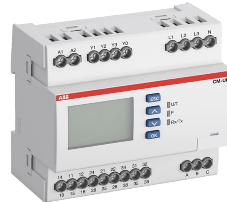
ABB Eco Solutions™

The CM-UFD series consists of multifunctional relays compliant to a wide array of international and regional standards, enabling the safe and reliable integration of renewable energy systems into public electricity grids all over the world. Furthermore, ABB's extensive product offering coupled with the CM-UFD, facilitates the seamless development of complete and comprehensive grid-feeding systems.