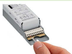
Inserting a conductor via push-in termination.