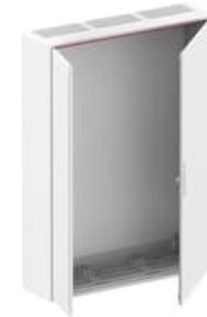
ABB Eco Solutions™

In electrical installation, efficiency, flexibility and high-quality requirements are closely linked. The ComfortLine wall cabinets from ABB combine these properties in an exemplary manner. Smart detailed solutions and further developments make the cabinets extremely versatile and user-friendly.