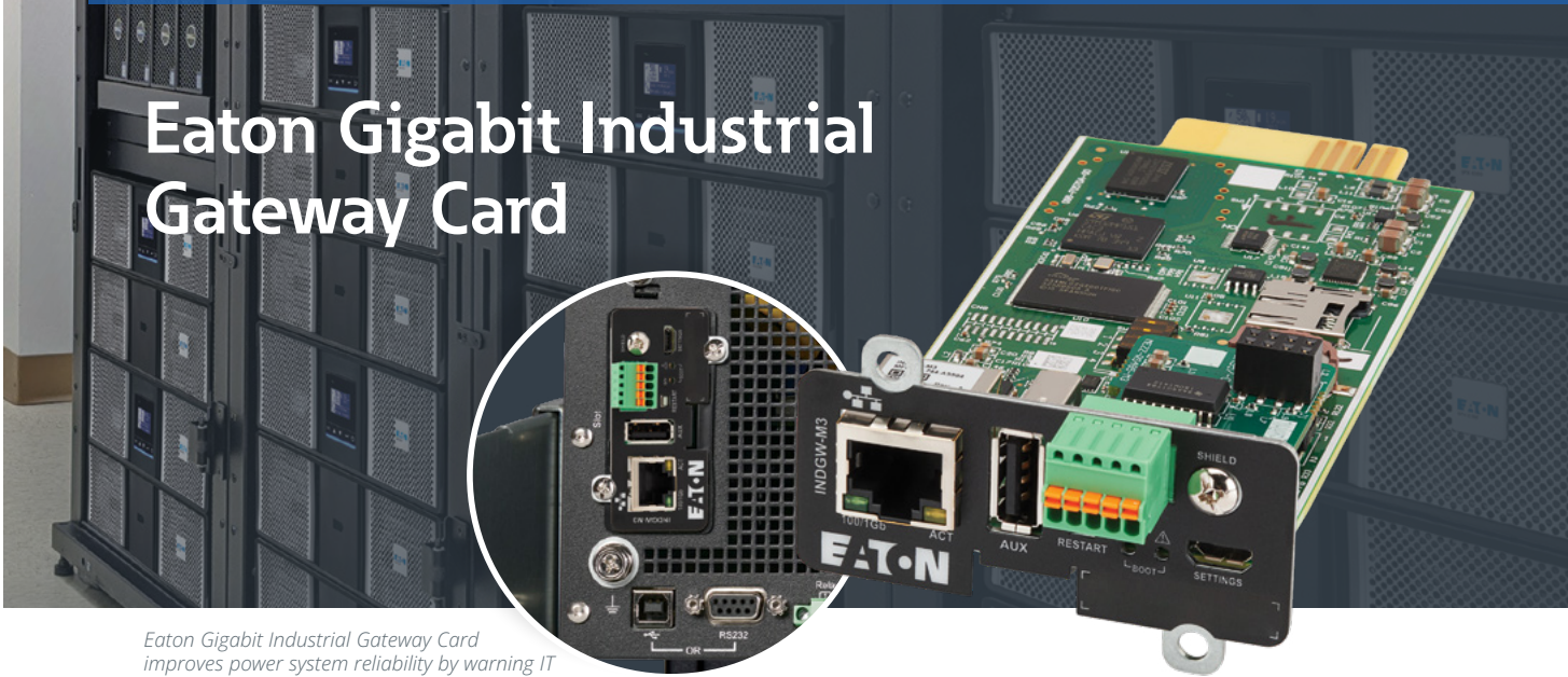
Eaton Gigabit Industrial Gateway Card improves power system reliability by warning IT administrators of pending issues.

Designed for critical infrastructure, Eaton's Gigabit Industrial Gateway Card (INDGW-M3) is a comprehensive power management interface with market-leading cybersecurity.