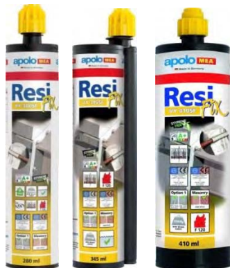
TWO-COMPONENT CARTRIDGE ADHESIVE

3 Characteristic bond strengths are for sustained loads including dead and live loads. For load combinations consisting of short term loads only, such as wind and seismic, bond strengths may be increased by 42 percent for temperature range A and 122 percent for temperature range B.