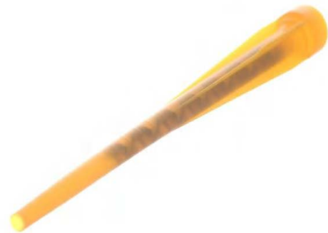
STATIC MIXING NOZZLE