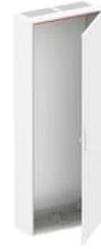
ABB Eco Solutions™

In electrical installation, efficiency, flexibility and high-quality requirements are closely linked. The ComfortLine wall cabinets from ABB combine these properties in an exemplary manner. Smart detailed solutions and further developments make the cabinets extremely versatile and user-friendly.