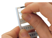
Separating a strip from the WMB or WMB marker card.