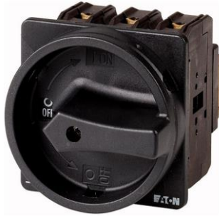
P3 Switch Disconnecter with Flush Mount