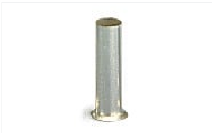
Color: ■ silver-colored