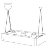
Twin wire suspensions Order: 1 x Mech/Elec 1 x Mech only