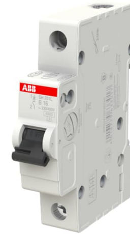
ABB Eco Solutions™

The SH200 range (with its variants SH200, SH200L, SH200M, SH200T) is designed to protect installations from overloads and short circuits, ensuring reliability and safety under all operating conditions