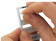
Separating a strip from the WMB or WMB marker card.