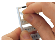
Separating a strip from the WMB or WMB marker card.