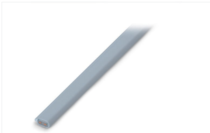
Color: ■ light gray