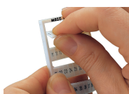
Separating a strip from the WMB or WMB marker card.