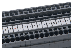
WMB "decade" marking