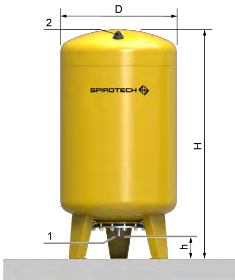
EVU6-90 .. EVU6-300