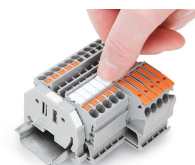
Separating a strip from the WMB or WMB marker card.