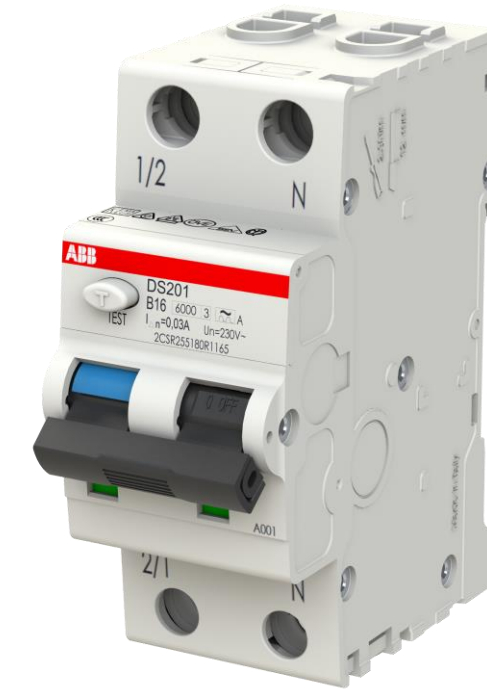
ABB Eco Solutions™

ABB Residual Current Circuit Breaker with Overcurrent Protection DS201, 1P+N protected, Type A-AC-APR-F, Tripping characteristic B-C-D-K, currents 6 \leq I_n \leq 40 , Rated sensitivity I_{\Delta n} 10mA-30mA-100mA-300mA and Rated short circuit breaking capacity (acc. to IEC/EN 61009-1) 4.5kA-6kA-10kA.