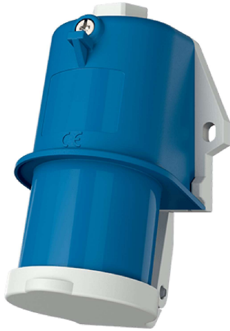
16A3P 6H230V wall mounted inlet TA IP 44 with lid